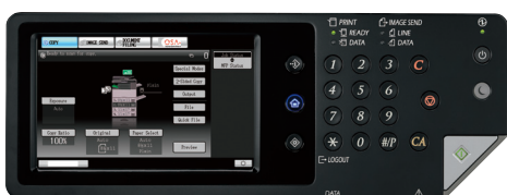
High resolution touch-screen color display