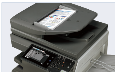
100-sheet reversing single pass document feeder